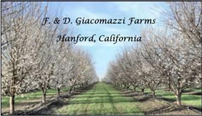
F. & D. Giacomazzi Farms Hanford, California