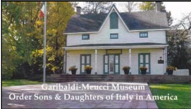
Garibaldi-Meucci Museum Order Sons & Daughters of Italy in America